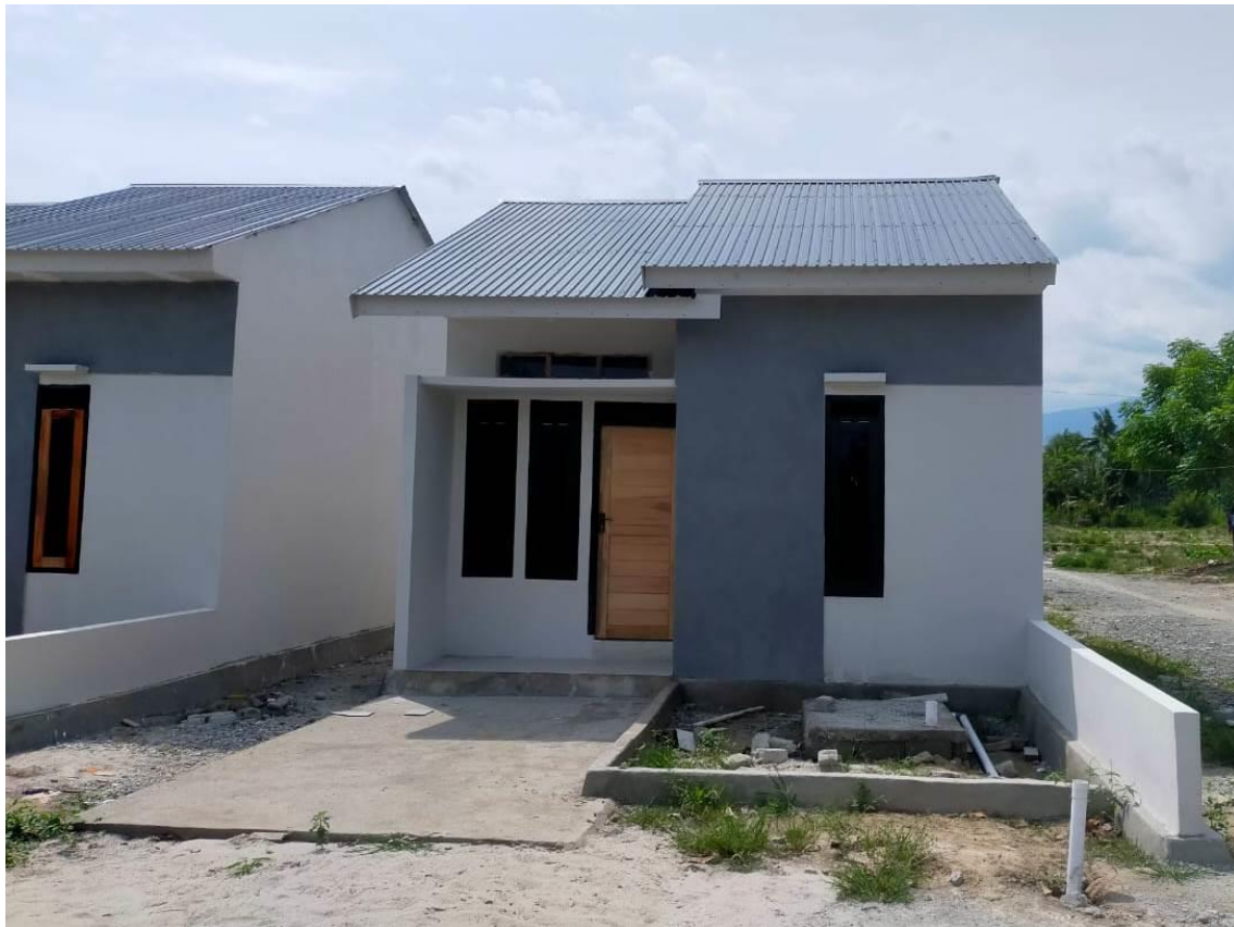
Figure 1 Typical House Type 36